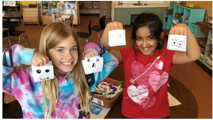
Above & Below: Paper puppets