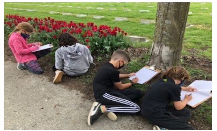
Above & Below: Div. 4 Outdoor learning