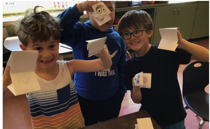
Below: Grade 2 math