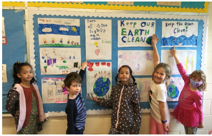
Above & Below: Div. 2 Earth Day artwork